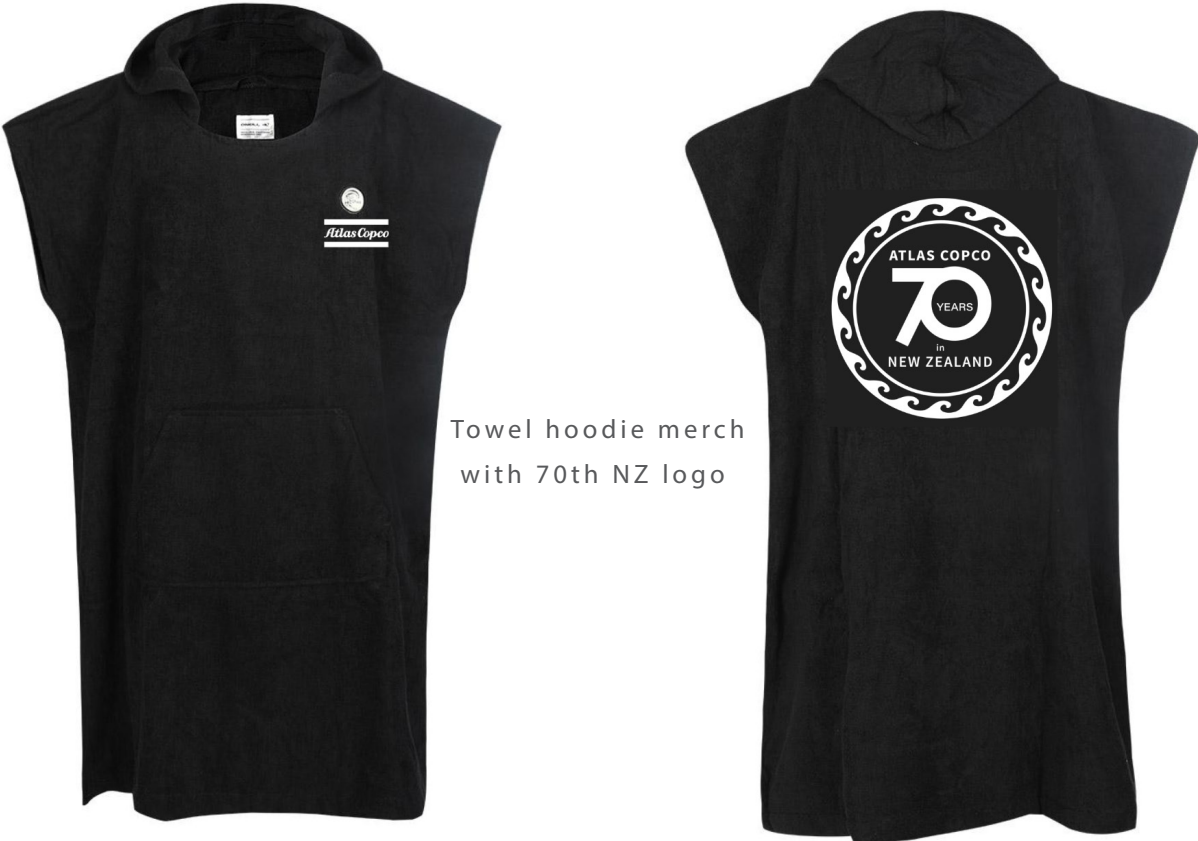
Towel hoodie merch with 70th NZ logo