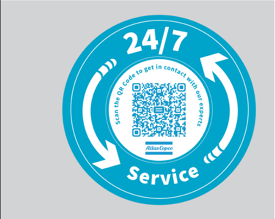
Printed Sticker -

A request to create a simple sticker design to be applied on company products to provide the clients quick access to contact with experts.